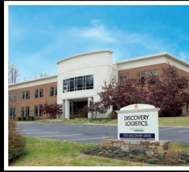
Discovery Facility, Charlottesville, VA