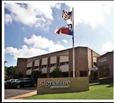
Headquarters Office, Austin, TX